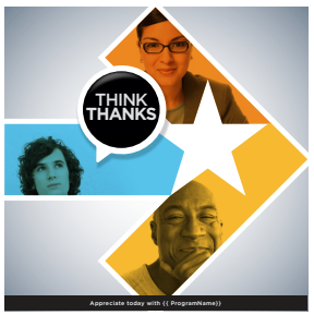
ONLINE BANNER/ ARTICLE